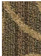
84407 Nice Tan