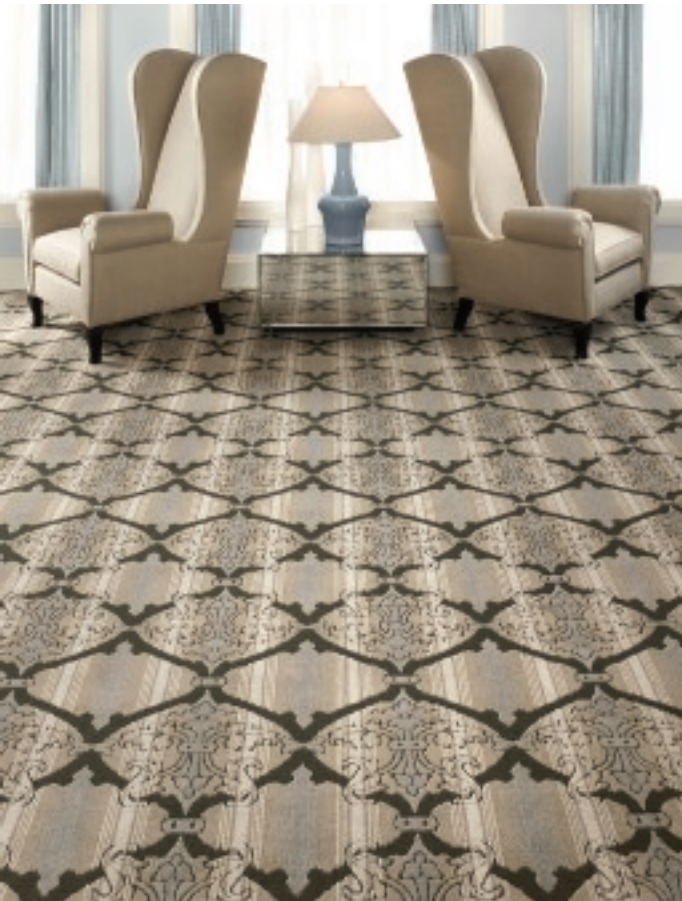
GRETA FAIRGATE | 958 WOAD

To view all of the patterns in the 10 available colors go to: www.meritcarpets.com