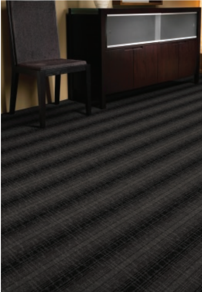
ZAHARA FAIRGATE | 985 Lichen