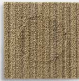
Duracolor With Antron ® Legacy