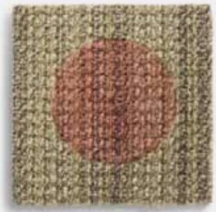
Competitor Solution Dyed / Yarn Dyed Blend