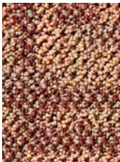
8683 Surprise Brown