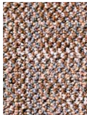
8718 Affection Tan