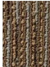
7896 Go Getter