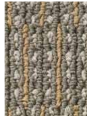
7973 Jump Start