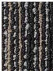
7989 Peak Awareness