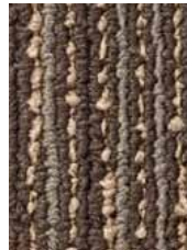
7868 Moving Up