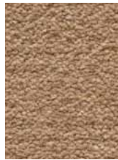
7330 Only Natural