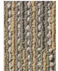
7973 Jump Start