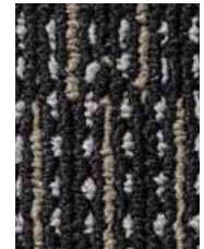
7989 Peak Awareness