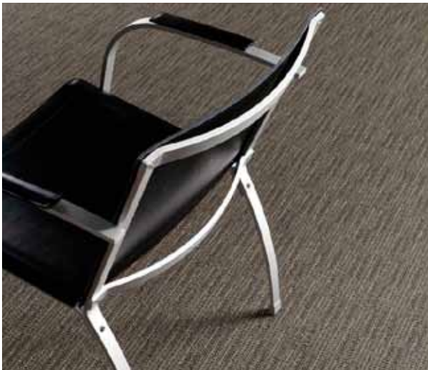
On The Rise