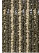
7698 In The Loop