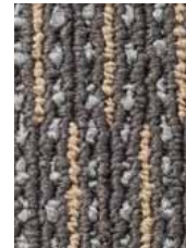
7987 Just Focus