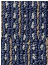
7587 Think Smart