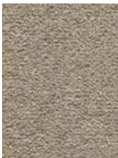
7945 Rushing River