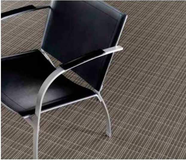
Made To Move