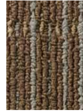
7896 Go Getter