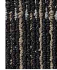
7989 Peak Awareness