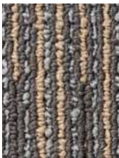
7987 Just Focus