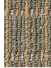
7973 Jump Start