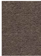
7450 Portabello Mix