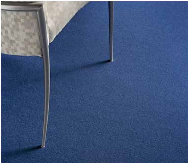
Spectrum V 30