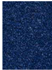
7622 Navy Pier