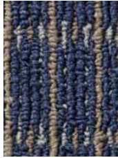
7587 Think Smart