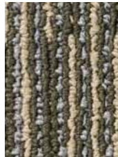
7698 In The Loop