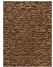
7876 Earth Scape