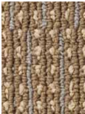
7194 On Target