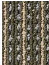
7698 In The Loop