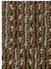
7896 Go Getter