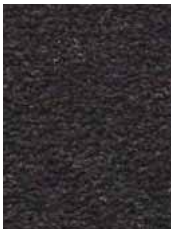
7234 Ebony Domino