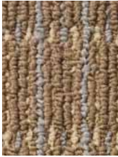
7194 On Target