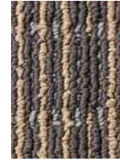
7987 Just Focus