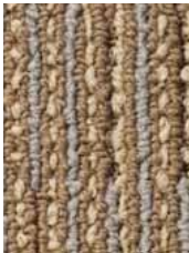
7194 On Target