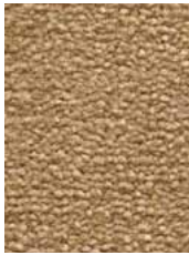
7264 Olive Grove