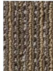
7916 Take Charge