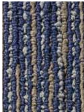
7587 Think Smart