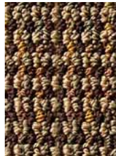
8658 Excitable Brown