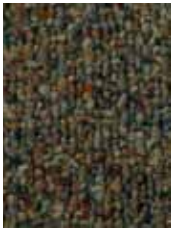
8122 Sunset Beach