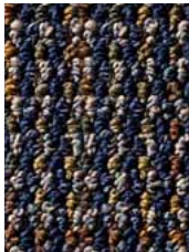
8575 Warm Blue