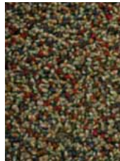
643 Avante Garde