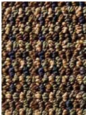
8556 Stirring Blue