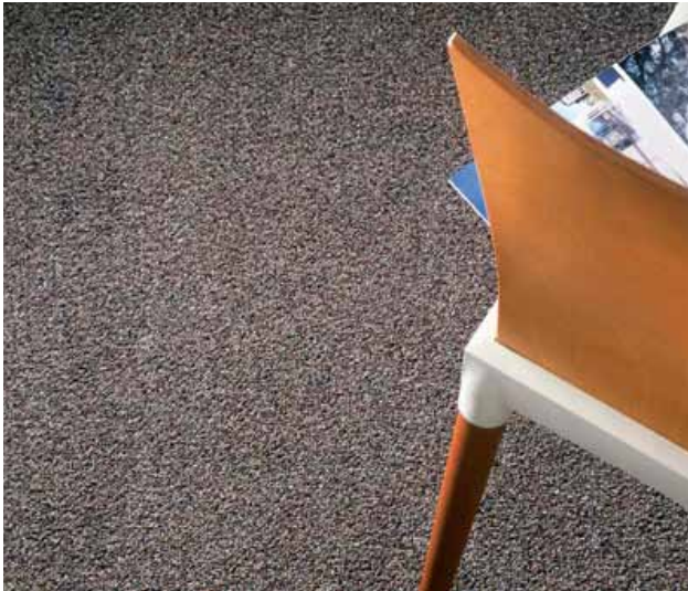
Stati-Tuft III EverSet