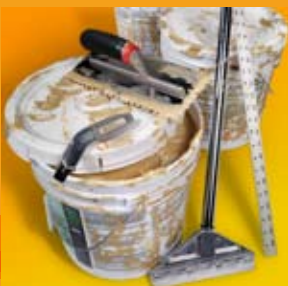
Tools and products required to install using traditional adhesives

*Start with a clean floor, then apply Mohawk approved floor sealer prior to carpet installation.